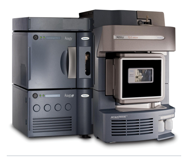
Figure 1. Waters ACQUITY UPLC I-Class Plus system and Xevo TQ-S micro.