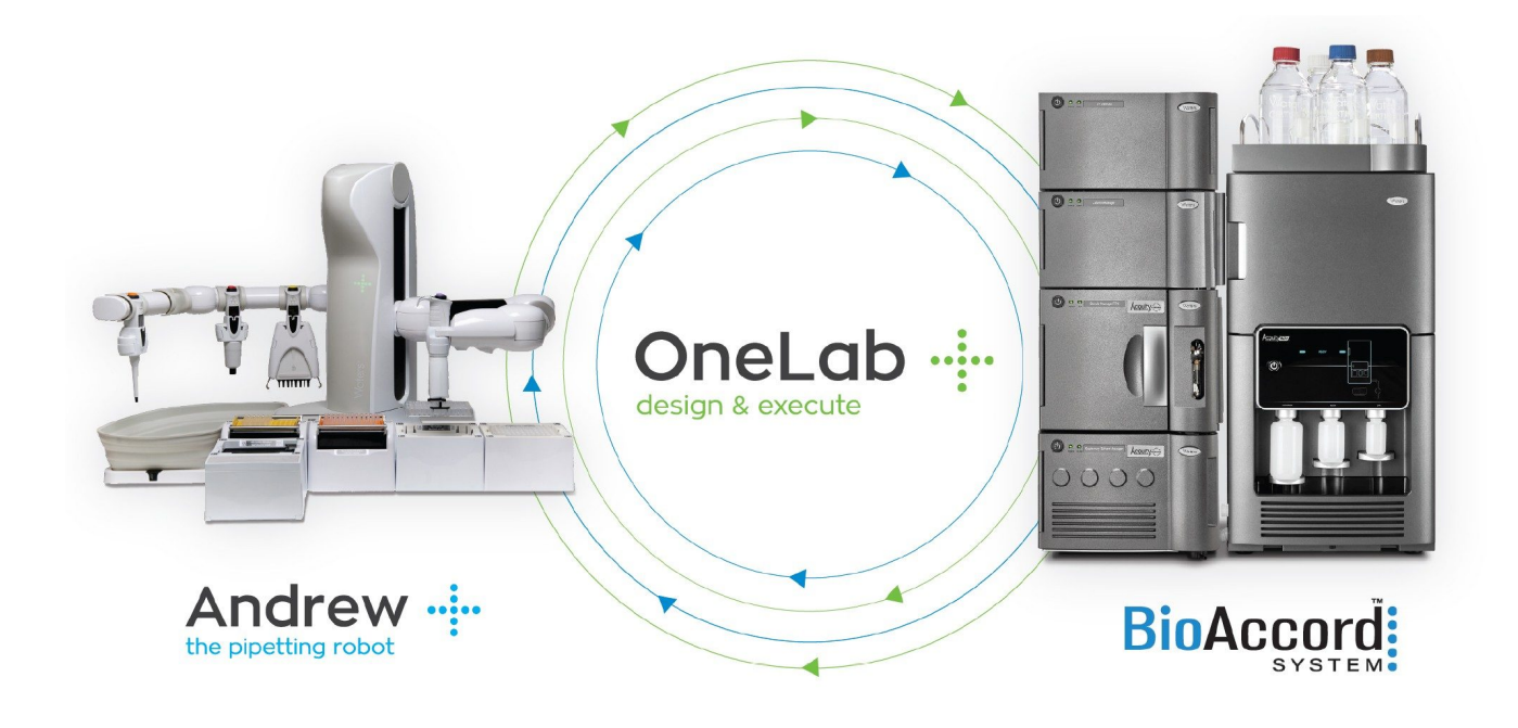
Figure 1. The Waters bioprocess walk-up solutions provide a single access OneLab software platform for automated sample preparation and LC-MS data acquisition and reporting.