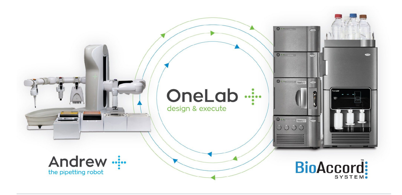
Figure 1. The Waters bioprocess walk-up solutions provide a single access OneLab software platform for automated sample preparation and LC-MS data acquisition and reporting.