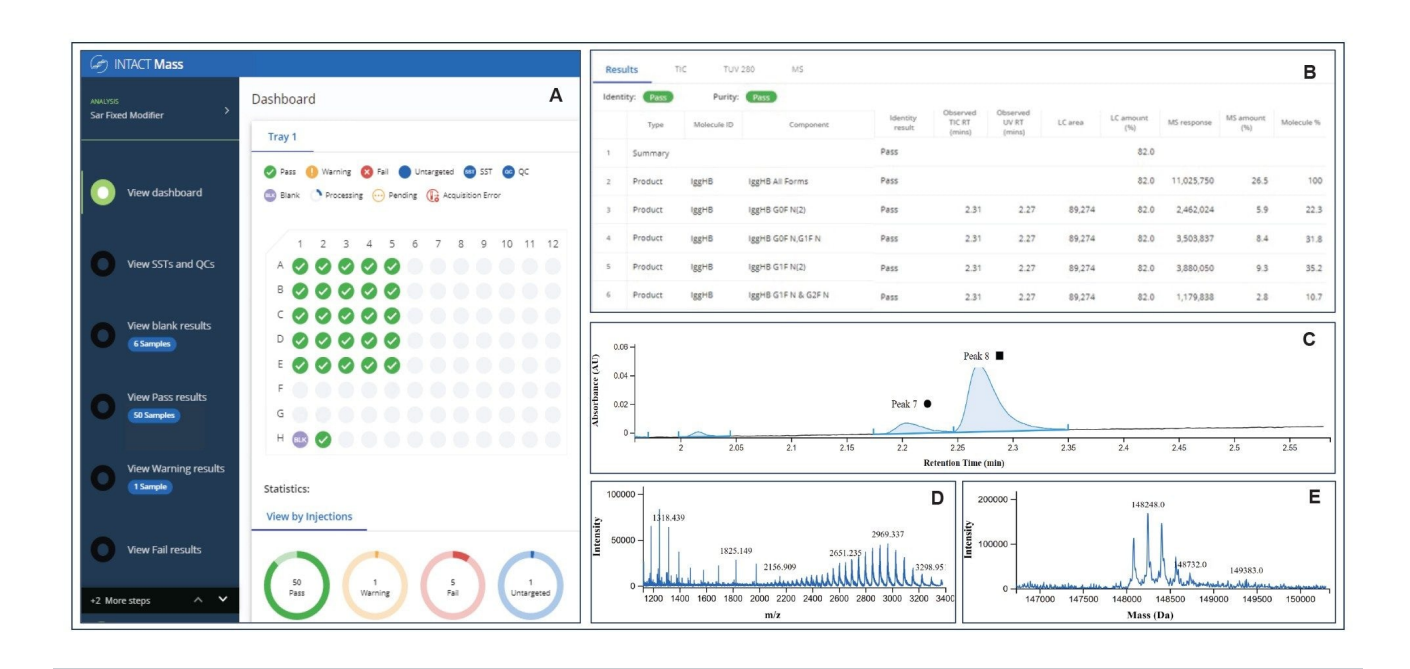
Figure 3. Display of Intact Mass App in the waters_connect™ platform. (A) Dashboard view showing injections and status of mAb detection, green color indicates the sample has passed detection criteria set in the method. (B) Summary table of modifications observed for the mAb produced including r.t., MS response, %modifications and other info. (C) Observed TUV chromatogram, which is used for peak detection. The first peak shown is light chain (LC) of the mAb, second peak is intact mAb. (D) Observed spectrum of the intact mAb peak, showing charge state distribution. (E) Deconvoluted spectrum of intact mAb, exhibiting the expected four major glycan modifications.

in the analysis method. By clicking on each sample, sample level information is displayed such as LC-MS chromatogram, protein modification result table, observed mass spectrum, and deconvoluted spectrum (Figure 3 B-D). In data export, the results are exported in a format that can be readily read into Ambr software or other third-party software for further data integration, viewing, and analysis. An example of Ambr data display showing an overlay of %modifications as a function of incubation time and bioreactors can be found in a previously published application note.<sup>1</sup>