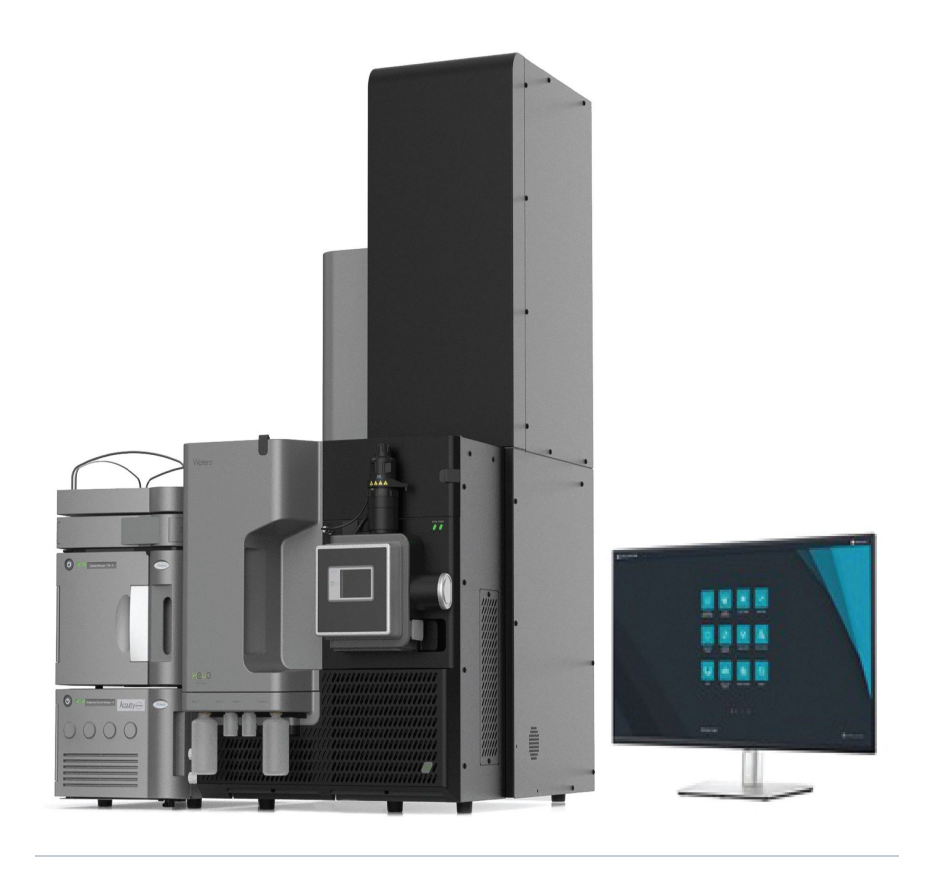
Figure 1. ACQUITY UPLC I-Class with the Xevo G3 QTof.