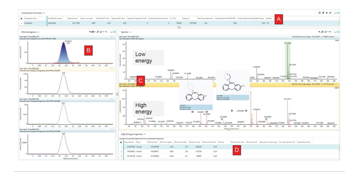
Figure 2. Detection of Clozapine identified in Test Solution 1 (System Suitability Mix), acquired in ESI positive. In this figure the upper table (A) details the results of the comparison of acquired data against the reference information contained in the Toxicology Library. Panel B displays the extracted ion chromatograms for the targeted precursor and the 3 diagnostic fragment ions and demonstrates that all ions are time-aligned at 6.23 minutes. The low and high energy spectra are shown in Panel C, and details of the fragment ions are listed in the lower table. Panel D.

A total of 27 parent drugs and/or their metabolites were detected, in the 20 urine samples for the ESI positive analysis, using the acceptance criteria. The detected drugs could be broadly divided into the following drug classes: amphetamines, antidepressant, antihypertensive, antimalarial, opiate/opioid, prescription/over-the-counter (OTC) medication, and sedatives. Their distributions are shown in figure 3. Overall, the data demonstrated excellent concordance with the previously characterized data on the Xevo G2-XS QTof.