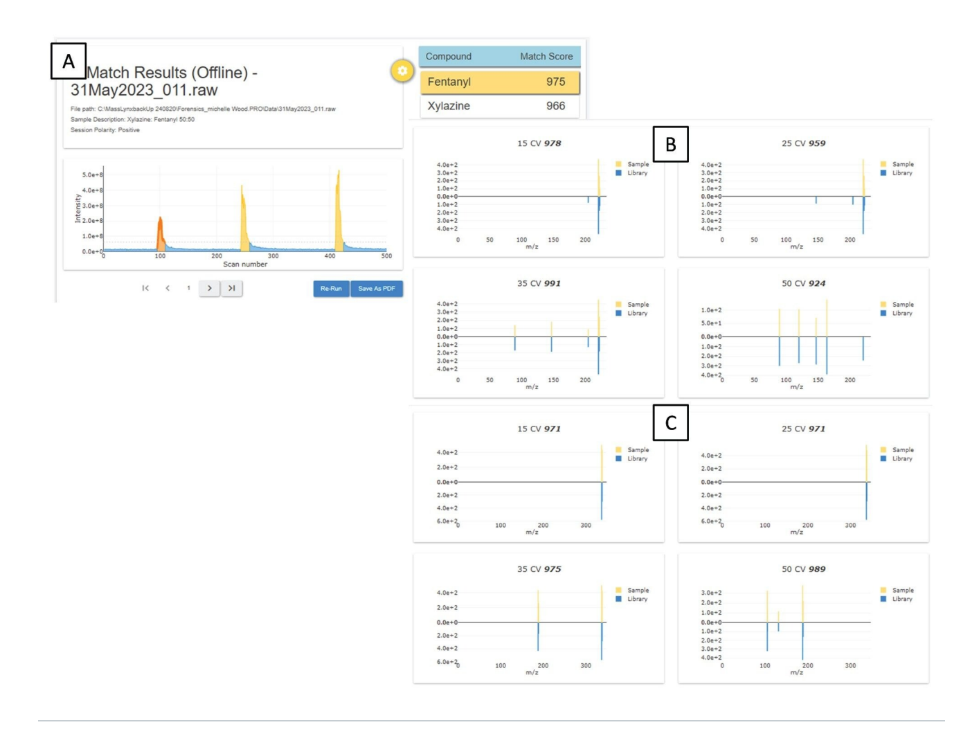
Figure 3. LiveID analysis of xylazine and fentanyl CRM mixture. Panel A shows triplicate analysis for the mixture and the match score 966 (xylazine) and 975 (fentanyl) for the first triplicate. Panel B displays the details for the spectral match for xylazine with the acquired sample and the new library entry. Panel C displays the details for the spectral match for fentanyl with the acquired sample and the library entry.

Analysis of the M-30 pill extract (average of triplicate RADIAN ASAP analysis) resulted in the positive identification of fentanyl with an average match score of 962.33 and an average match score of 781.67 for xylazine (for the first triplicate analysis, xylazine was detected with a match score of 826). There were detections (match score >800) for additional compounds, including metodesnitazene, paracetamol and caffeine. This showed good agreement with results obtained from the analysis of the M-30 pill, except for metodesnitazene, using confirmatory LC-ToF analysis.<sup>8</sup> Figure 4 shows the LiveID results obtained for the analysis of the M-30 pill