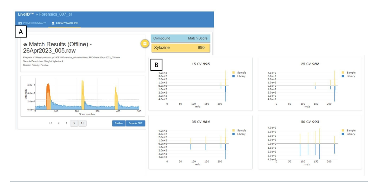
Figure 2. LiveID analysis of xylazine CRM at 10 \mu g/mL. Panel A shows triplicate 'dip and detect' analysis for xylazine reference material and the match score 990 for the first triplicate. Panel B displays the details for the spectral match with the acquired sample and the new library for each cone voltage.

Data was processed using LiveID in combination with the updated library. Substances analyzed included xylazine at three different concentrations (10 \mu g/mL, 50 \mu g/mL, and 500 \mu g/mL) producing match scores >980 (range 981 to 995). Figure 2 shows an example of the LiveID result obtained for xylazine CRM at a concentration of 10 \mu g/mL.