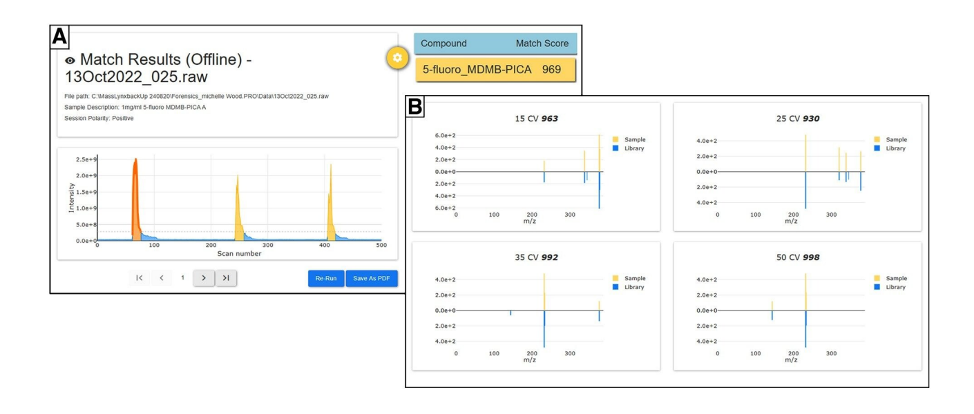
Figure 3. LiveID analysis of a sample prepared, infused with 50 uL of 5-Fluoro MDMB-PICA using the pipetting method. Panel A shows three "dip and detect" paper replicates for the infused sample and the match score 969 (maximum 1000) obtained for the first replicate. Panel B displays the detail for this spectral match; all four cone voltages are used in the identification process with a weighted mean (lowest cone voltage with the highest weighting) used.

In this study, samples at a lower concentration were also assessed; 6 samples were infused with individual drugs at 0.2 ng/mL. These samples resulted in slightly lower match scores than those infused with 1 mg/mL, however the match scores obtained still exceeded the threshold used for positive identification.