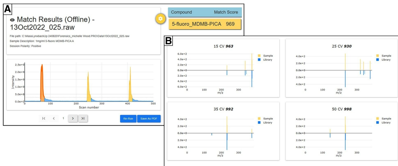
Figure 3. LiveID analysis of a sample prepared, infused with 50 \mu L of 5-Fluoro MDMB-PICA using the pipetting method. Panel A shows three “dip and detect” paper replicates for the infused sample and the match score 969 (maximum 1000) obtained for the first replicate. Panel B displays the detail for this spectral match; all four cone voltages are used in the identification process with a weighted mean (lowest cone voltage with the highest weighting) used.

In this study, samples at a lower concentration were also assessed; 6 samples were infused with individual drugs at 0.2 ng/mL. These samples resulted in slightly lower match scores than those infused with 1 mg/mL, however the match scores obtained still exceeded the threshold used for positive identification.