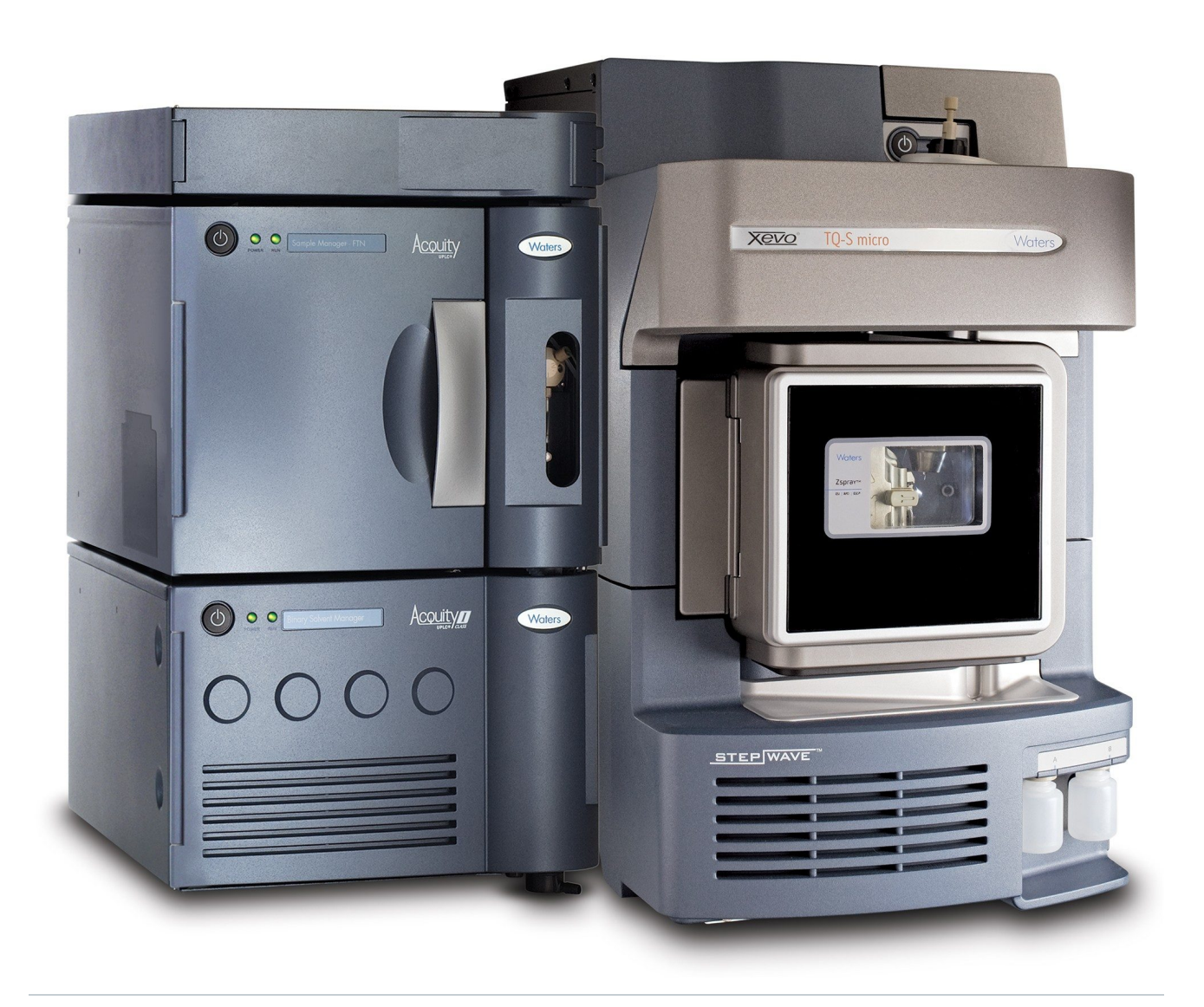
Figure 1. ACQUITY UPLC I-Class and Xevo TQ-S micro configuration.