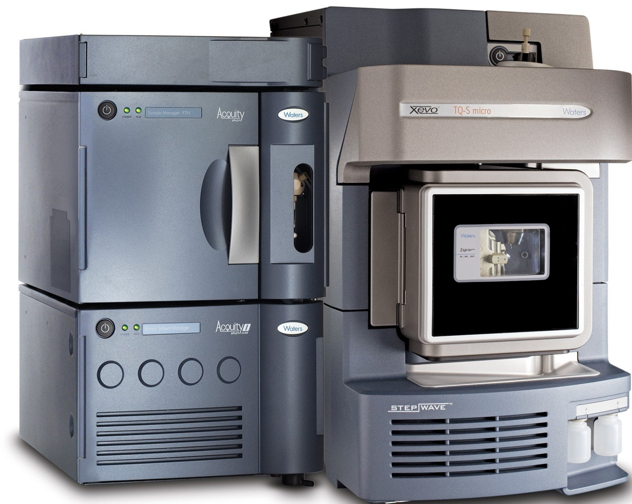
Figure 1. ACQUITY UPLC I-Class and Xevo TQ-S micro configuration.