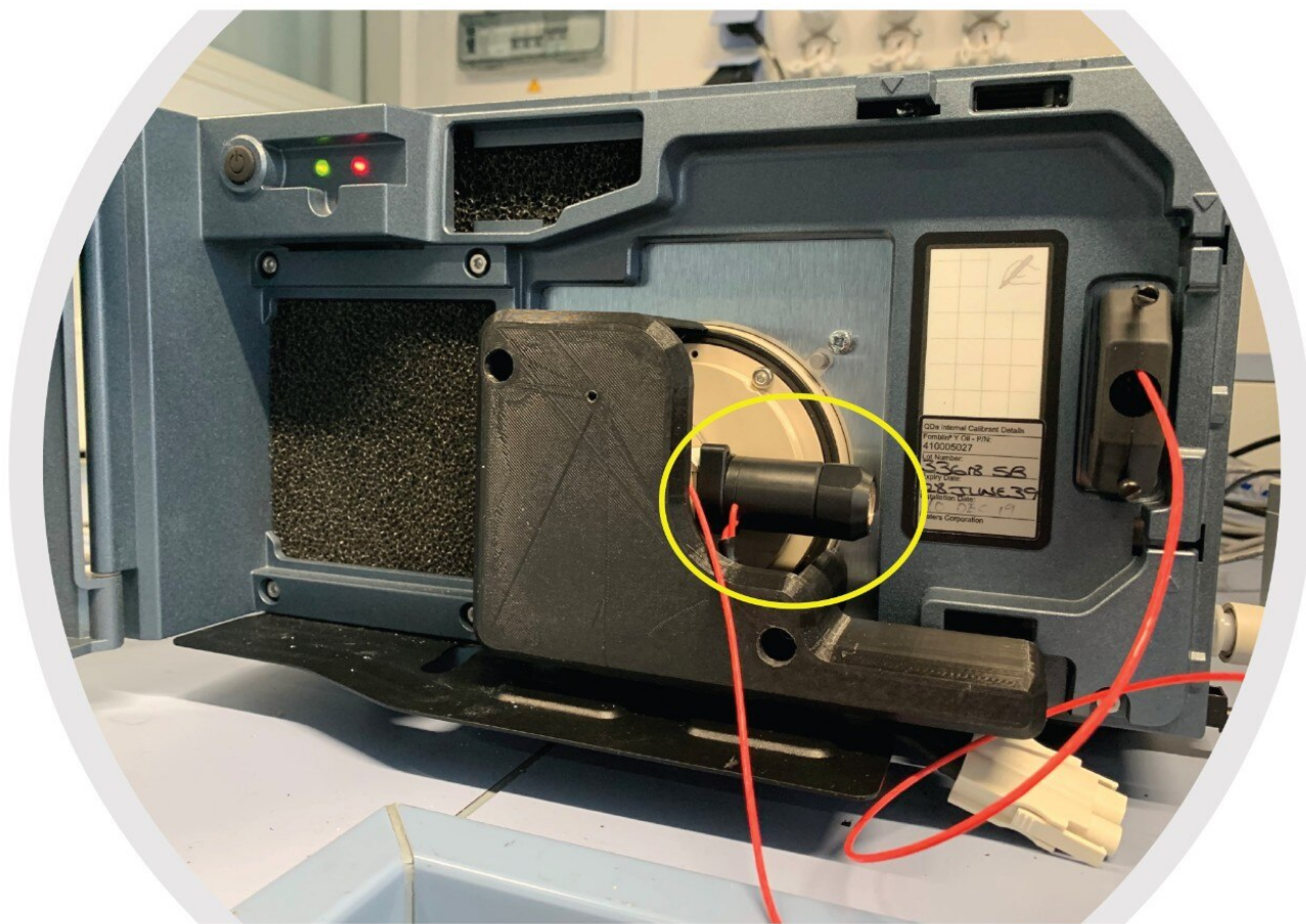
Figure 1. Plasmion SICRIT coupled to a Waters ACQUITY QDa Detector.