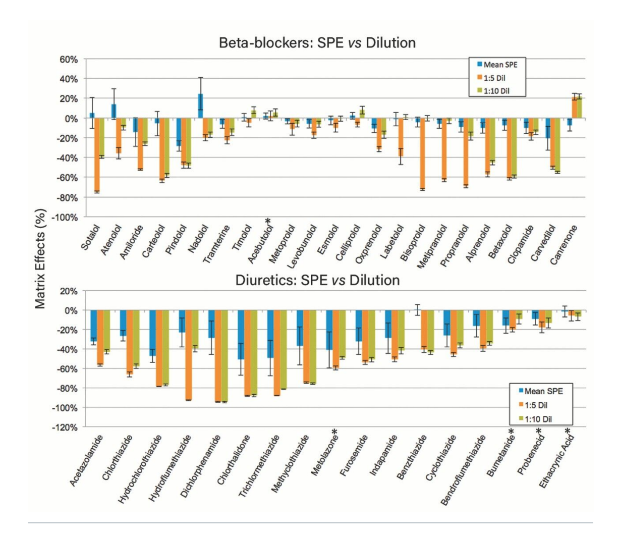
Figure 3. Matrix effects for beta-blockers and diuretics. Mean matrix effects from 12 lots of urine were compared to matrix effects from 1:5 and 1:10 dilution of pooled blank urine in 97:2:1 H_2 O:ACN:formic acid. Even at 1:10 dilution, ion suppression was significantly increased in the diluted samples compared to those prepared by SPE with the MAX µElution plate (N=12 for mean SPE matrix effects and N=4 for the diluted samples). Asterisks indicate compounds in which matrix effects were NOT different between SPE prepared and diluted samples.

All compounds were readily detectable, even at 20% of WADA's Minimum Required Performance Level (MRPL) of 100 ng/mL for beta-blockers and 200 ng/mL for the diuretic compounds.<sup>5</sup> Retention time tolerances were well within WADA requirements as well.<sup>5</sup> Despite the speed of the analysis and the need for polarity switching, WADA ion ratio criteria for confirmation were met for all compounds, even at 20% of the MRPL.<sup>6</sup>