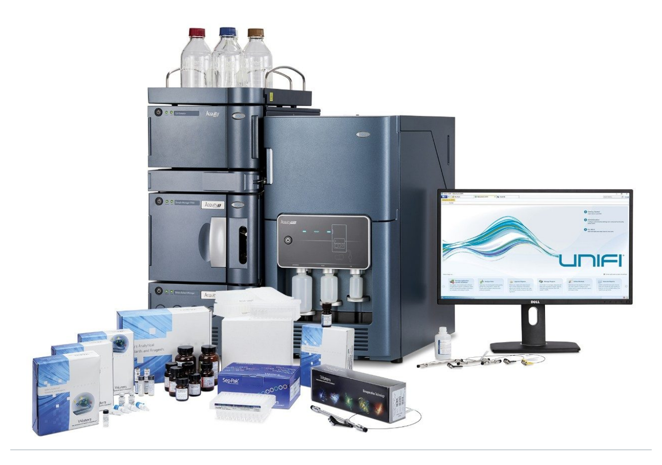
Figure 1. Glycan Application solution using automated GlycoWorks RapiFluor-MS N-Glycan Kit and BioAccord System with UNIFI Software.

key structural information and has been extensively used as an orthogonal analytical technique for glycan characterization in biotherapeutics development.