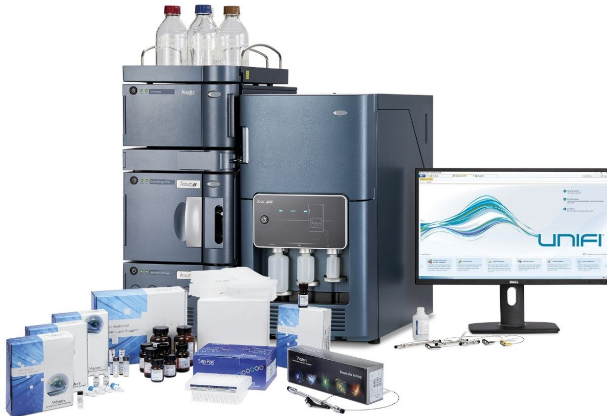
Figure 1. Glycan Application solution using automated GlycoWorks RapiFluor-MS N-Glycan Kit and BioAccord System with UNIFI Software.

key structural information and has been extensively used as an orthogonal analytical technique for glycan characterization in biopharmaceuticals development.