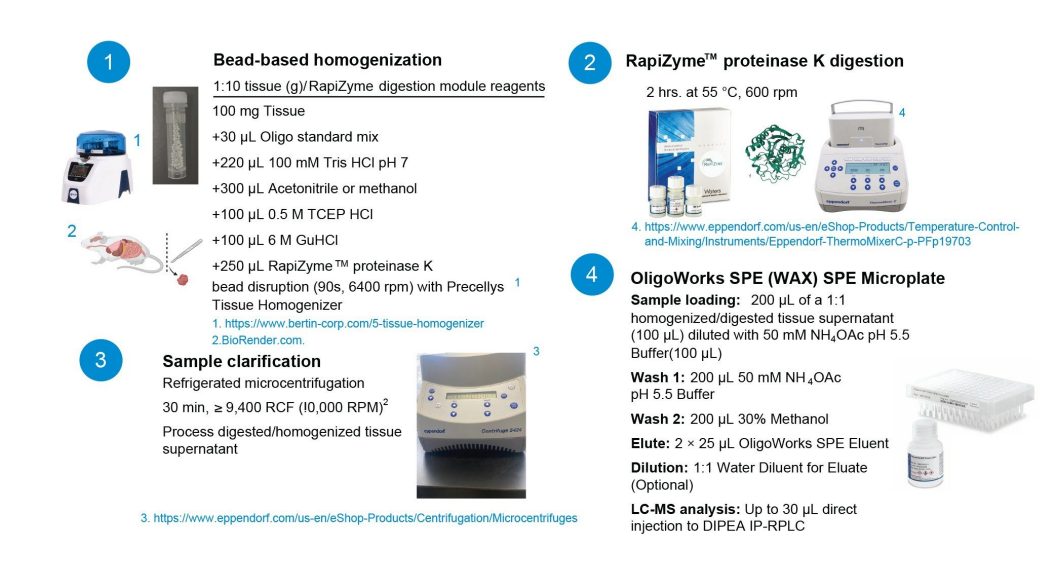
Figure 1. Oligonucleotide tissue extraction workflow and protocol using solvent assisted tissue homogenization and digestion with RapiZyme Proteinase K Digestion Module and OligoWorks SPE Microplate-2 mg/well.

Note: equipment referenced is what we use in our lab, but alternate equipment with equivalent capabilities may be used instead.