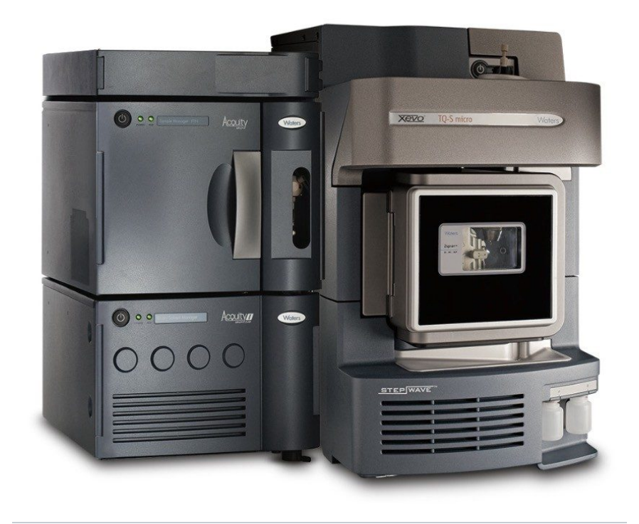
Figure 1. The Waters ACQUITY UPLC I-Class system and Xevo TQ-S micro.