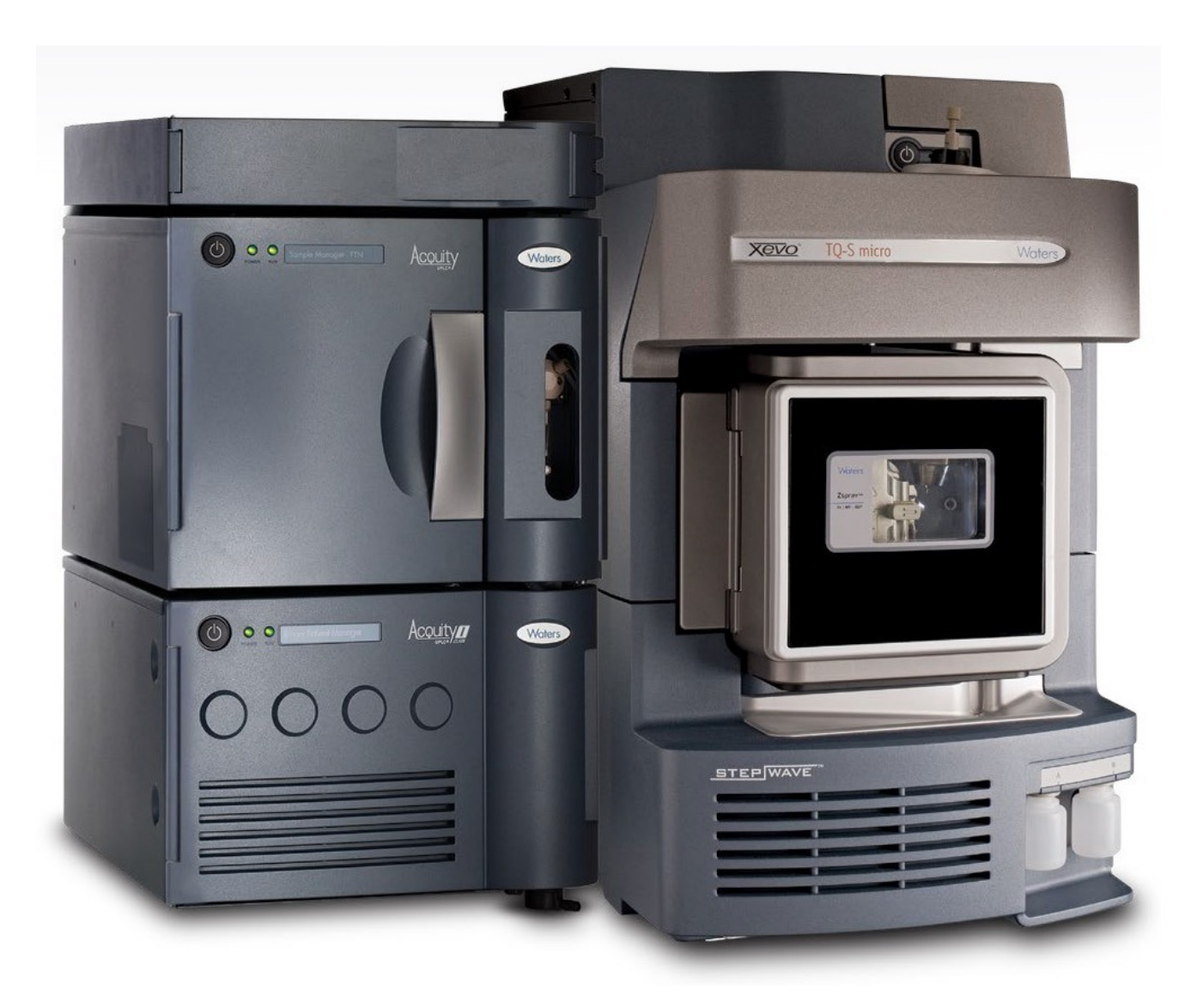
Figure 1. ACQUITY UPLC I-Class System and Xevo TQ-S micro.

The technique uses in-source collision induced fragmentation at various cone voltages followed by library matching using the ChromaLynx Application Manager. Previous analysis of mixtures of drug substances using the Xevo TQ-S micro indicated that the cone voltages required to produce comparable fragmentation patterns were higher than those used with the previous generation mass spectrometers (e.g. Xevo TQD), therefore modified libraries were prepared and evaluated. Figure 2 shows a comparison of spectra obtained on the two platforms, highlighting the additional 30 V applied to the cone for each function on the Xevo TQ-S micro.