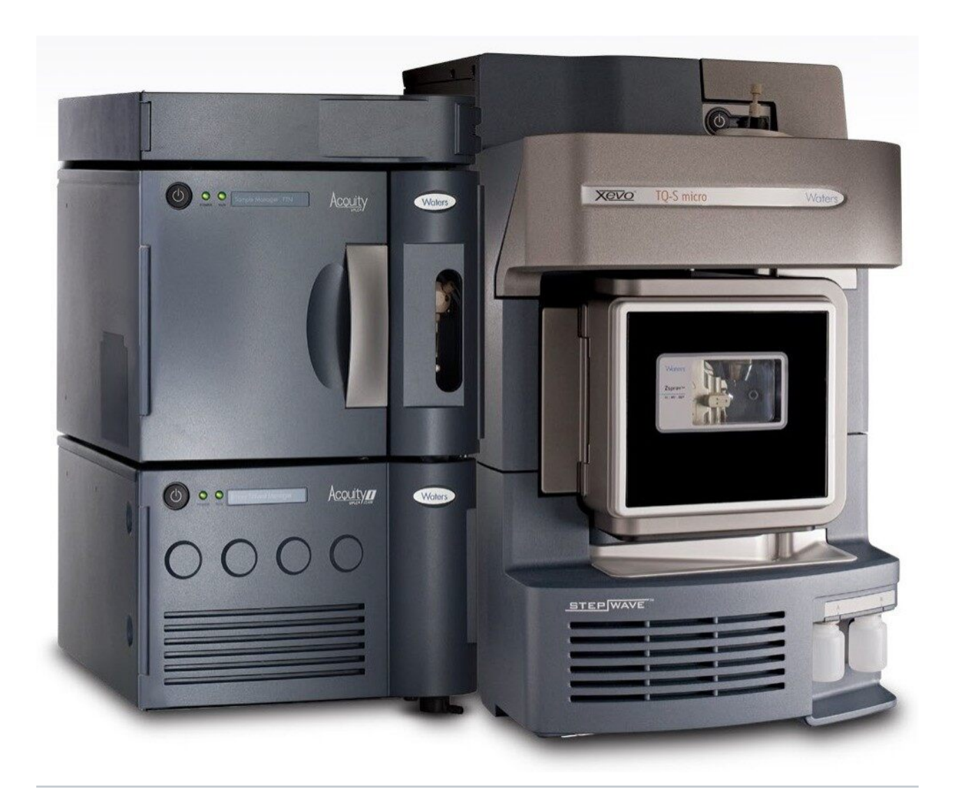
Figure 1. ACQUITY UPLC I-Class System and Xevo TQ-S micro.

The technique uses in-source collision induced fragmentation at various cone voltages followed by library matching using the ChromaLynx Application Manager. Previous analysis of mixtures of drug substances using the Xevo TQ-S micro indicated that the cone voltages required to produce comparable fragmentation patterns were higher than those used with the previous generation mass spectrometers (e.g. Xevo TQD), therefore modified libraries were prepared and evaluated. Figure 2 shows a comparison of spectra obtained on the two platforms, highlighting the additional 30 V applied to the cone for each function on the Xevo TQ-S micro.