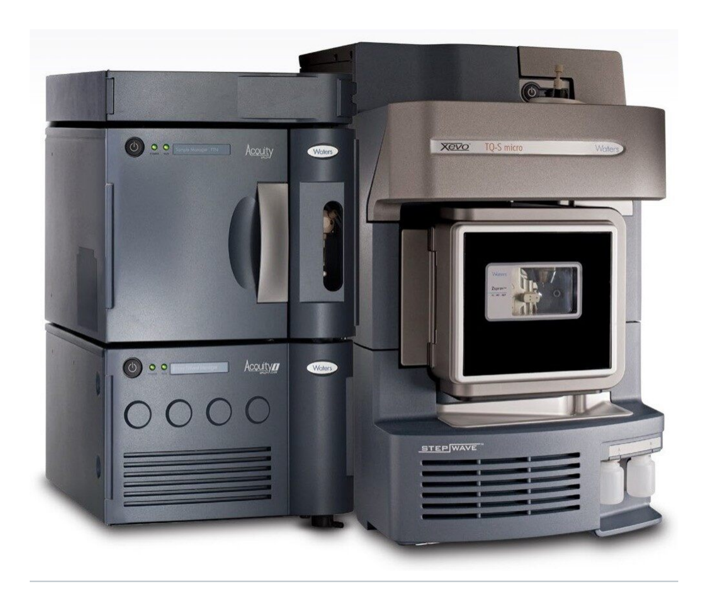
Figure 1. ACQUITY UPLC I-Class System and Xevo TQ-S micro.

The technique uses in-source collision induced fragmentation at various cone voltages followed by library matching using the ChromaLynx Application Manager. Previous analysis of mixtures of drug substances using the Xevo TQ-S micro indicated that the cone voltages required to produce comparable fragmentation patterns were higher than those used with the previous generation mass spectrometers (e.g. Xevo TQD), therefore modified libraries were prepared and evaluated. Figure 2 shows a comparison of spectra obtained on the two platforms, highlighting the additional 30 V applied to the cone for each function on the Xevo TQ-S micro.