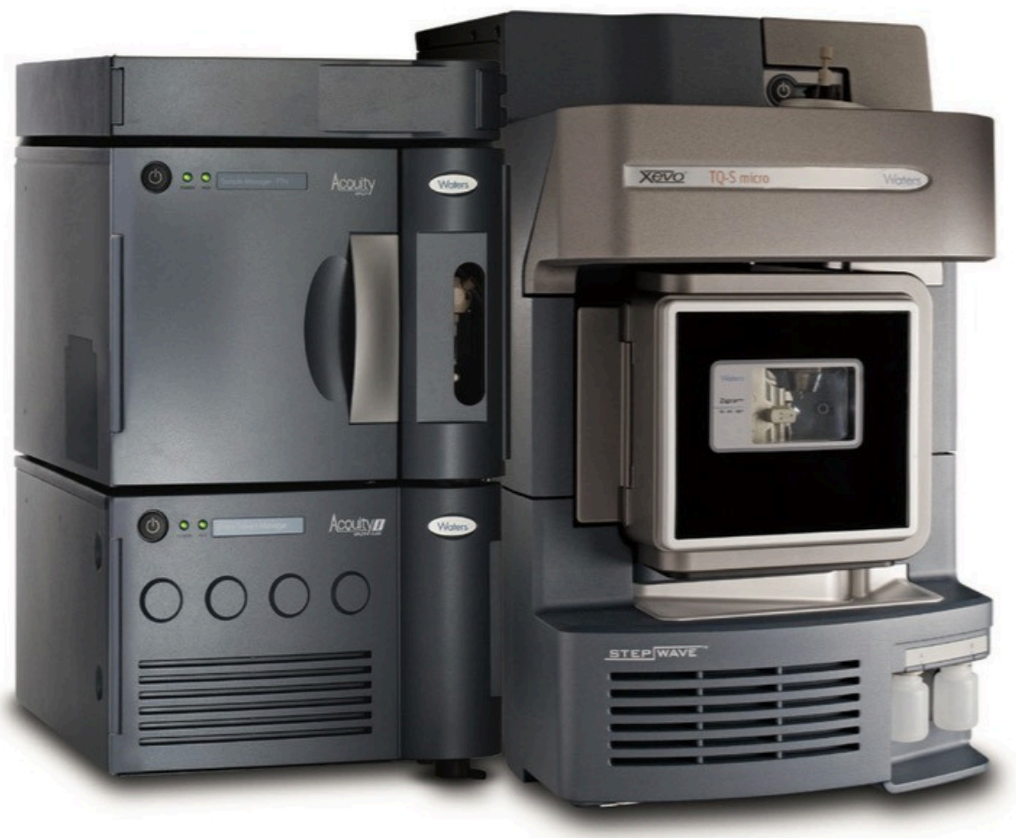
Figure 1. ACQUITY UPLC I-Class and Xevo TQ-S micro configuration.

Combining the ACQUITY UPLC I-Class with the Xevo TQ-S micro allows this established UPLC-MS/MS screening methodology to be used on the latest generation of Waters mass spectrometers.