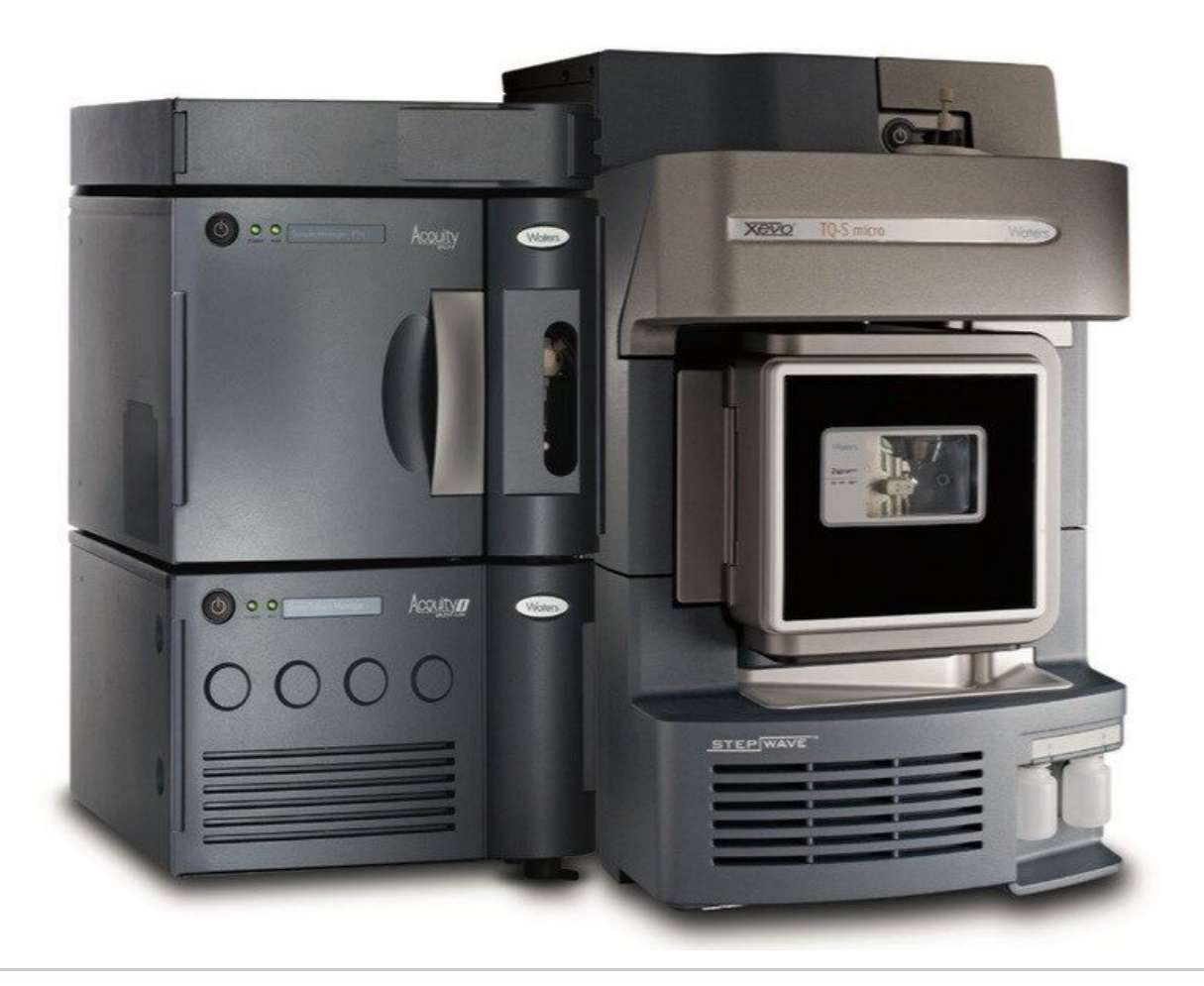
Figure 1. ACQUITY UPLC I-Class and Xevo TQ-S micro configuration.

Combining the ACQUITY UPLC I-Class with the Xevo TQ-S micro allows this established UPLC-MS/MS screening methodology to be used on the latest generation of Waters mass spectrometers.