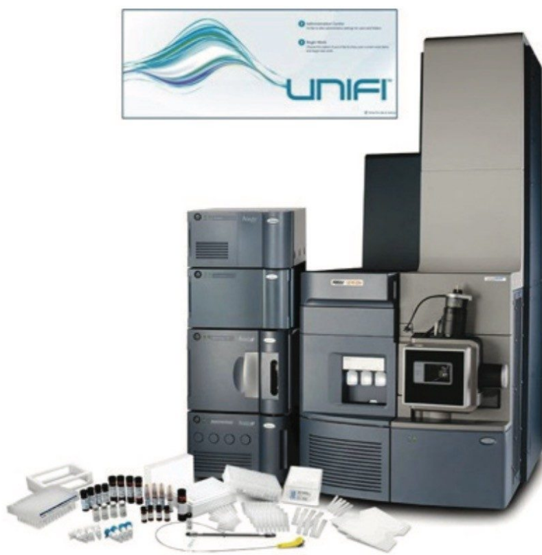
Figure 1. Biopharmaceutical System Solution with UNIFI for glycan analysis.